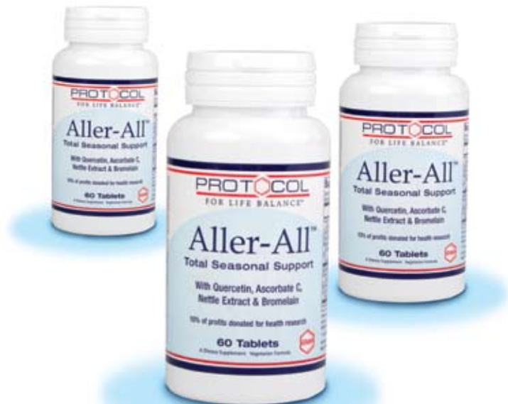
Aller-All™ Total Seasonal Support