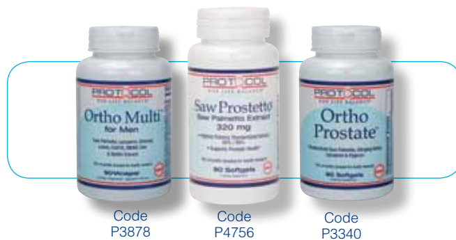
Recommended Men's products

See www.protocolforlife.com for more products